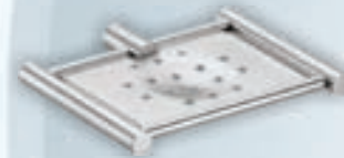
Soap Dish ESD 01