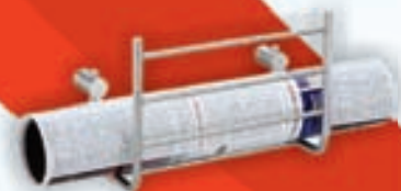
Magzine Holder Code - EMH 01 (Length - 200 mm)