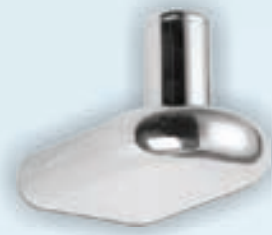
Coat Hook (Single) Code - EC04