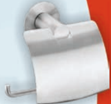
Toilet Paper Holder Code - EPH 04F (With Flap)