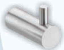
Coat Hook (Single) Code - EC01