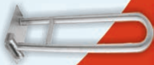
Handicap / Disabled Grab Bar (Swing) Code - EGR S02 (Length - 750 mm)