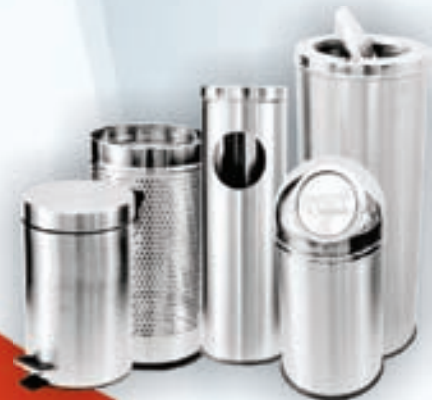
S. Steel Bins Various Sizes Available