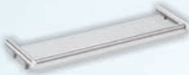
Steel Shelf ESF 01 (400 mm)