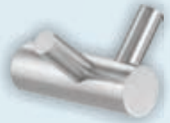
Coat Hook (Double) Code - EC02