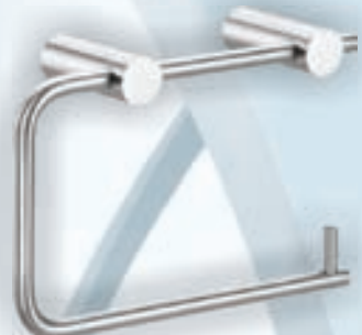
Toilet Paper Holder Code - EPH 02

All accessories are made of Non-Corrosive Rust - Resistant Stainless Steel necessary for high humidity levels in the bathroom