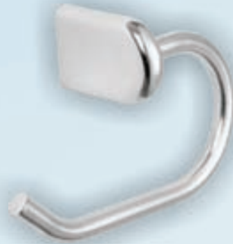
Toilet Paper Holder Code - Kinox EPHK05