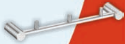
Coat Hook (Triple) Code - EC 03