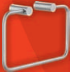
Towel Rail (Square Shape) Code - ETR 05